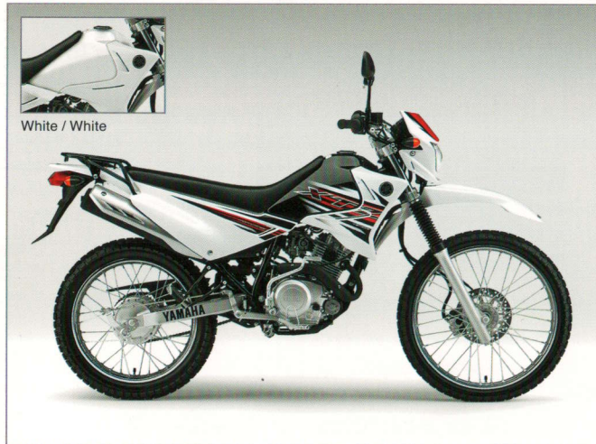
White / White